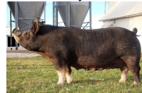
FKB3 LADY IMF W 21-7